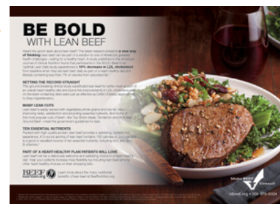
Top and middle: Academy of Nutrition & Dietetics Conference. Bottom: Health ad placed in state physician magazines