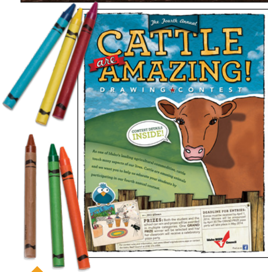
Top: The winning "Cattle are Amazing!" drawing contest entry. Bottom: Cattle are Amazing! contest information poster.